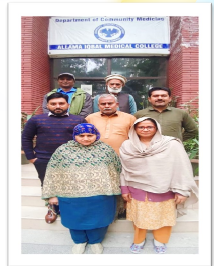
The Backbone of C.Med

Department collaborates with government agencies, non-governmental organizations, and international partners to design and implement evidence-based interventions, advocates for health policy changes, and to build capacity for health system strengthening. C.Med is well-equipped with teaching venues, supported by HEC digital library, excellent research facilities and a public health laboratory.