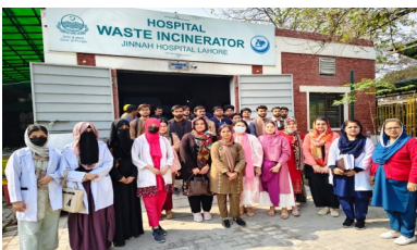
Visit to Hospital Waste management department JHL