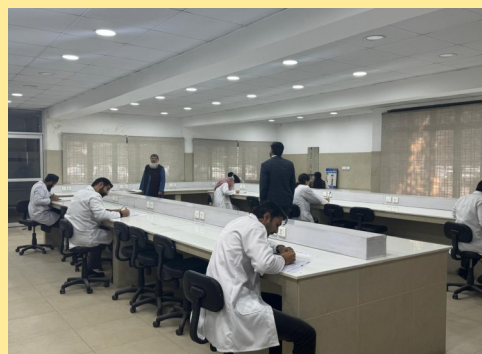
OSPE in progress

All faculty members of C.Med department performed examination duty in three batches: invigilators, paper assessors and result compilation. A total of 100 students were divided into 4 batches. The visiting faculty was invited to a lavish tea which was attended by all members of the C.Med AIMC. Dr. Ayesha Humayun appreciated the smooth conduct of UHS examination and thanked CMED faculty and support staff for warm welcome and support. Reported by Afia Arshad