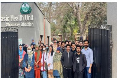
Visit to BHU Shamke Bhattian