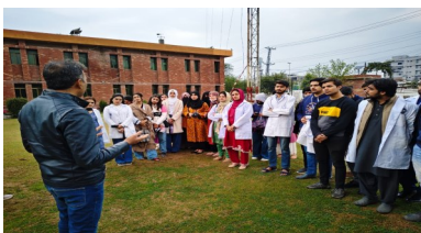
Visit to Meteorological Department